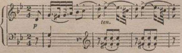
No. 15. Andante cantabile.