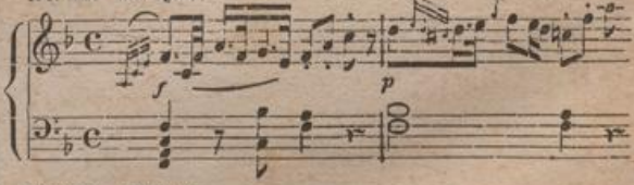
No. 30. Allegro.