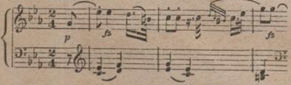
No. 9. Adagio.