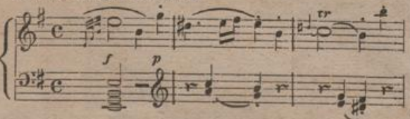
No. 10. Allegro moderato.